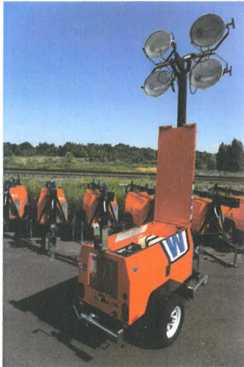
Hinged top panel opens fully. The light tower mast attaches to the panel for maintenance and raises the panel using the drawbar winch.

Wanco has created a unique innovation that greatly improves serviceability. For complete access to the engine, generator and electrical components, the Wanco Light Tower features a hinged top panel that rises with the mast when maintenance is required. No other light tower makes engine access this easy. The gull-wing side doors may be opened while the maintenance panel is raised, further enhancing access.