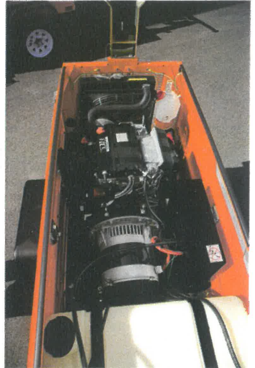
Engine and components are easily accessible with top panel up. Crossbar can be removed and side doors can be opened with panel raised.